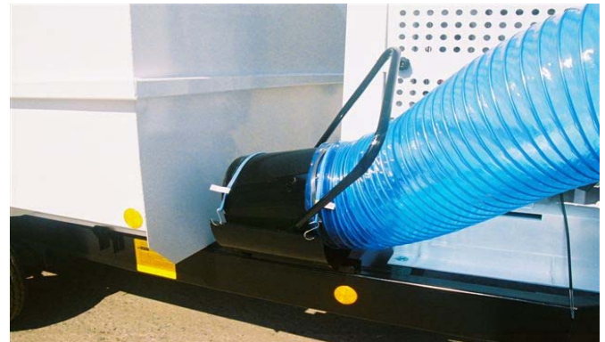
Intake Hose Holder