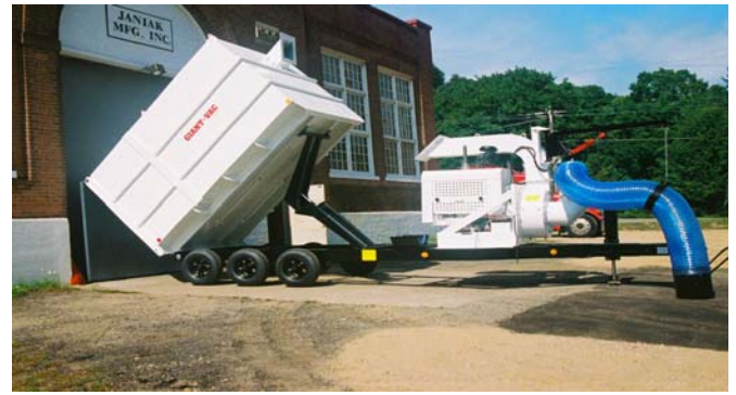
Heavy-Duty Dump Hoist