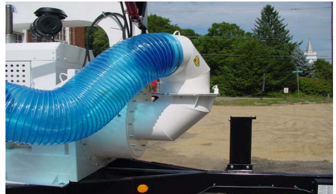
90-Degree Intake Swivel Elbow