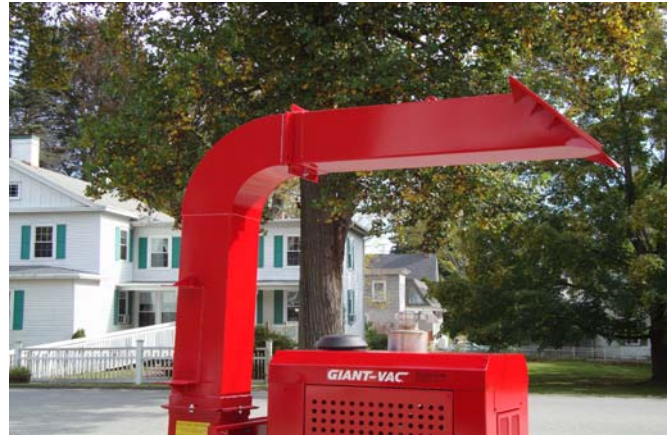
TR-Style Exhaust Discharge Fixed Mount Option

We reserve the right to discontinue models or change specifications without notice.