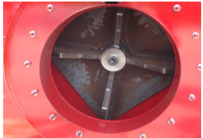
Impeller 4-Blade, 3/4-inch Steel